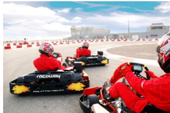
Junior Membership is available. Please see 'Junior Karting Activities' document.

Your personal Al Ain Raceway membership card, containing your individual membership number , will also gain you access to all the exclusive Member and VIP rates for any of Al Ain Raceway's special event formats throughout the year.